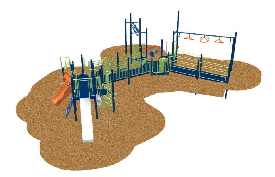
Figure 1. Larger play structure with accessible ramps and features

Option 2 – Rube Goldberg Miracle Machines. These sensory type play structures are features that focus on sensory friendly play that benefit all ages. The installation of these pieces will require accessible surfacing. This piece of equipment was really well received by the Accessibility Advisory Committee on May 23<sup>rd</sup>, 2024. Each piece costs approximately $10,500 plus HST, with an estimated $5000 for the purchase of accessible surfacing (surfacing cost will depend on the number of Miracle Machines purchased and amount required to cover the appropriate surface area).