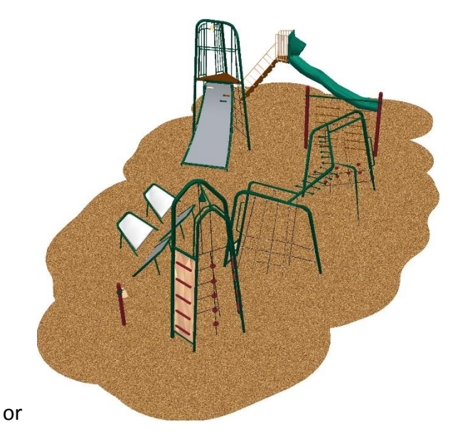
Figure 4. Ninja Ropes Course – (something similar to this, with a few less features to meet our budget)

Option 4 – Interactive Art. Similar to the art pieces installed around the community in 2023, staff would work with the local arts community to design and install interactive art in the location previously occupied by the playground structure. Depending on the size, style and material, staff would work with the local arts community to keep this project under $20,000.