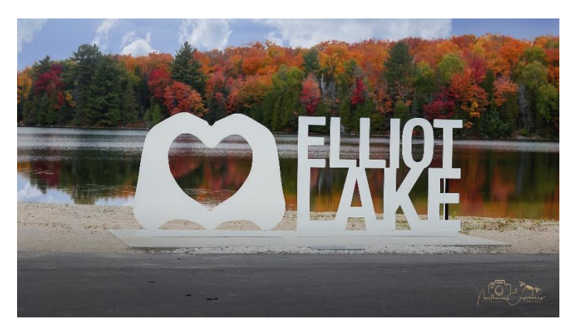
Figure 5. Example of interactive art project

Option 4 – Interactive Art. Similar to the art pieces installed around the community in 2023, staff would work with the local arts community to design and install interactive art in the location previously occupied by the playground structure. Depending on the size, style and material, staff would work with the local arts community to keep this project under $20,000.