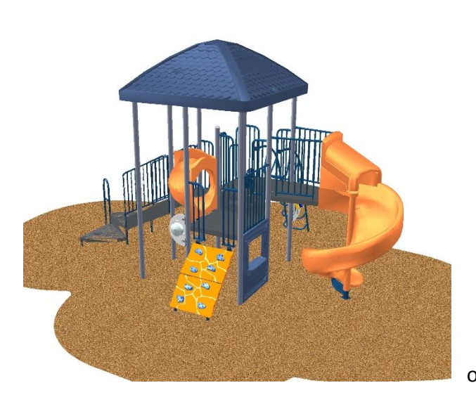
Figure 3. Smaller Play Structure

accessible features will be required. A smaller playground structure has a smaller footprint than the design in Option 1. Adding Miracle Machines to the park will offer features for all to participate at the playground. Designing a Ninja Ropes Course or smaller playground structure, with the installation of a Miracle Machine, plus appropriate surfacing would cost approximately $50,000 - $60,000 plus HST.