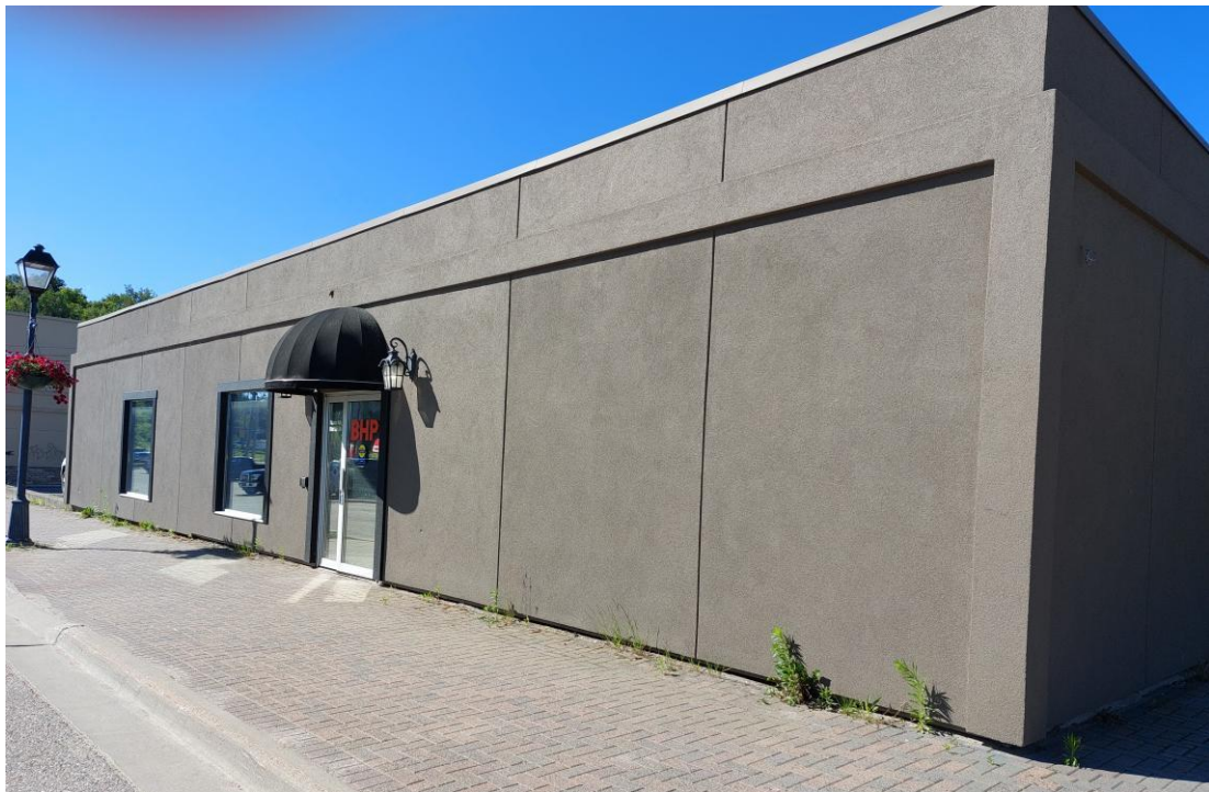
Partial blank wall on the BHP building (Note previous partial blank wall is to the right; this creates a corner blank space)