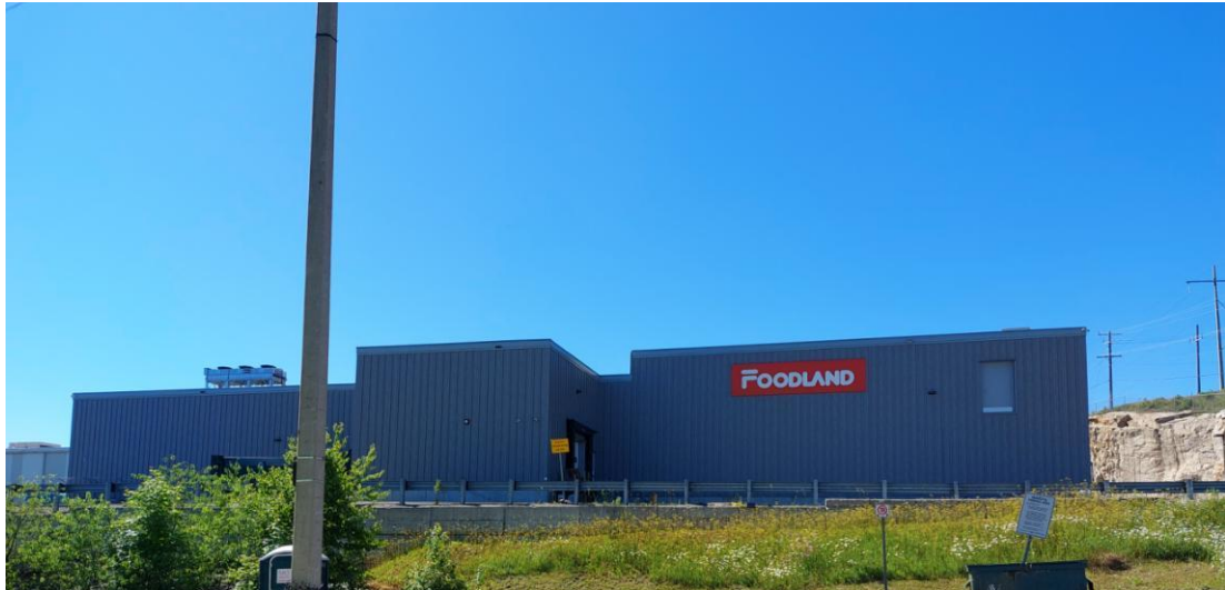
A canvas waiting for art.