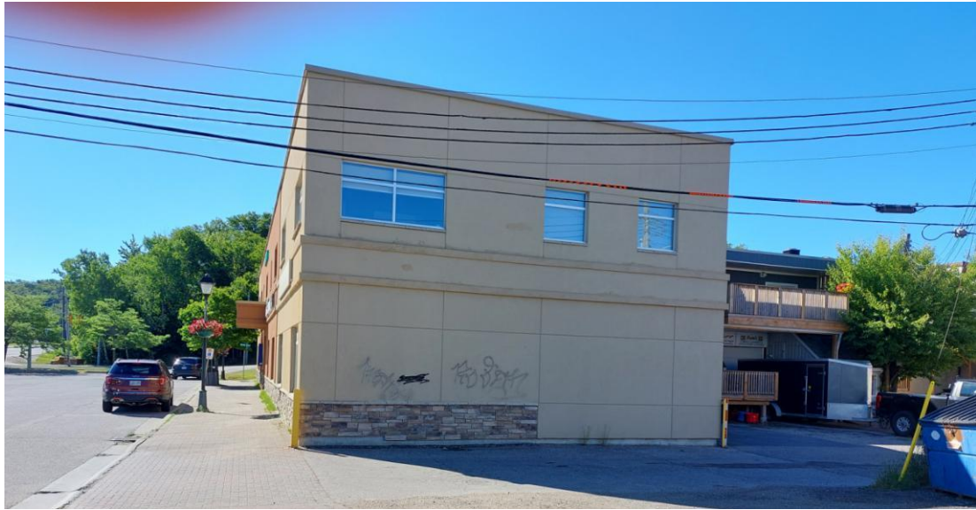
This is a partial blank wall. The frieze like band separates the window area from the blank space below.