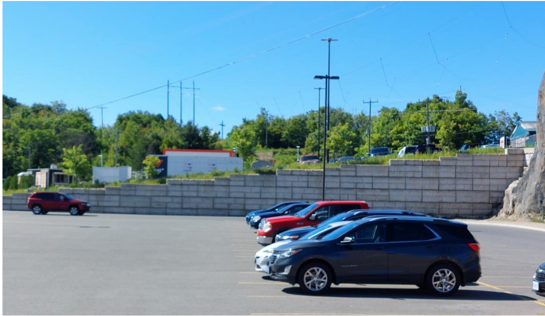
Retaining wall between the plaza and Canadian Tire