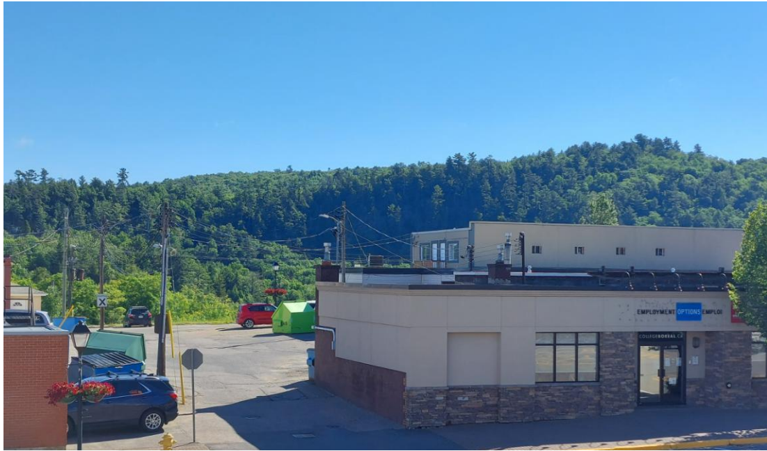
Blank wall on the end of the employment building.