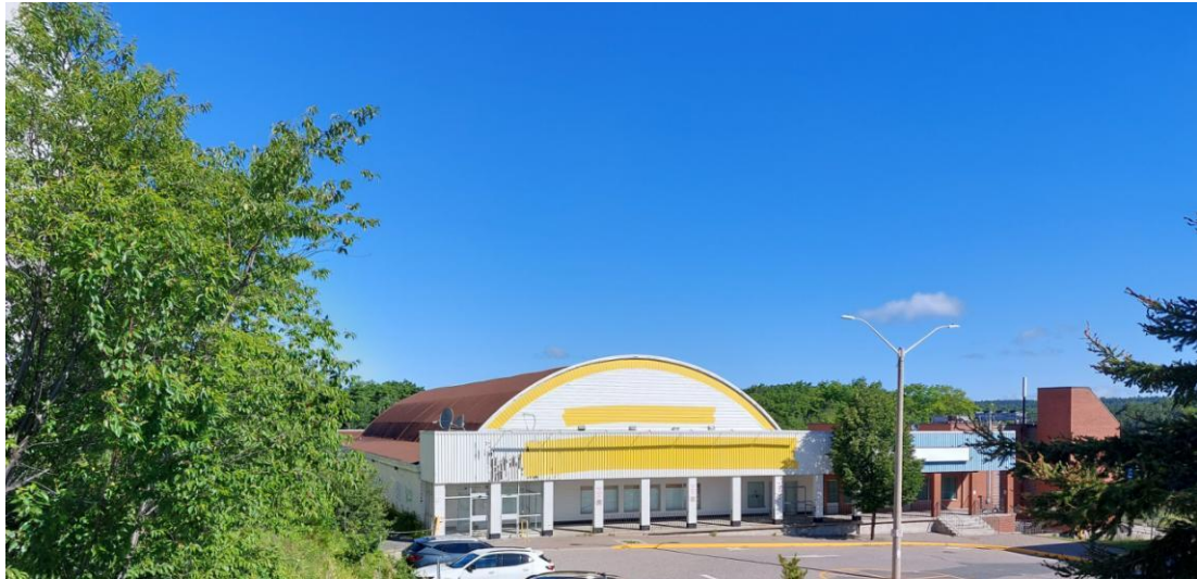
Former Melanie's building with curved roof.