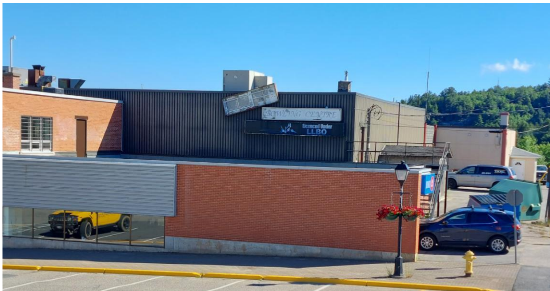
Partial blank wall.