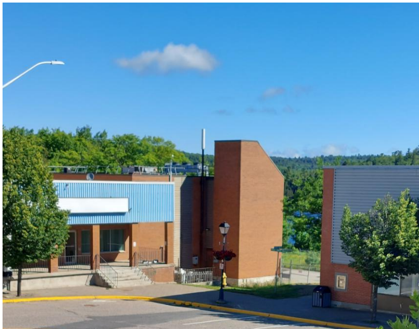
Long tall blank wall that faces St. Mary Walk. (Sliver of a lake view)