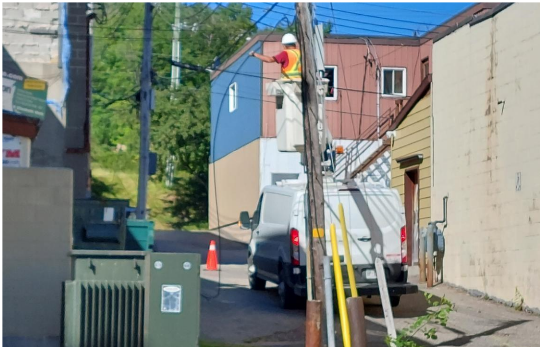
At the top of the alley is another blank space that could tie the top end of downtown to the art in the lower part of town.