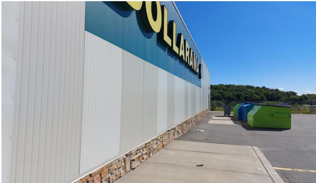
East side of Dollarama