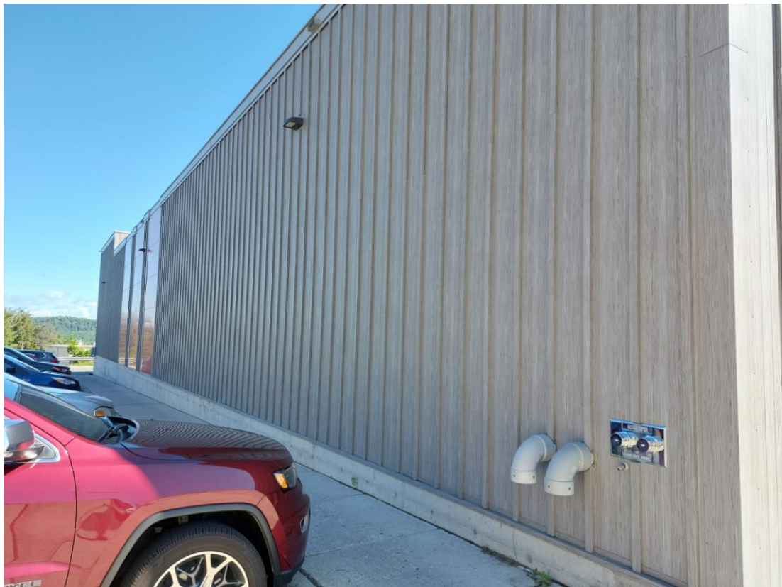
Foodland - the wall that runs from the back of the building to the front on the north side.