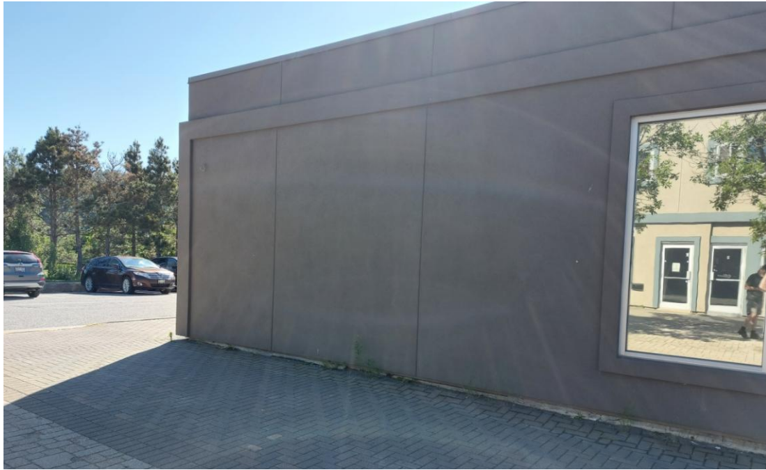
Partial blank wall in the pedestrian area near the LCBO