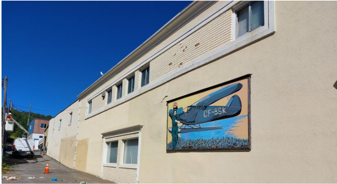
The float plane art (The alley was incredibly untidy.)