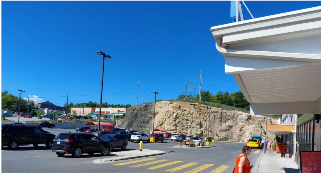
The rock...note the screen to protect people and cars from rock fall.